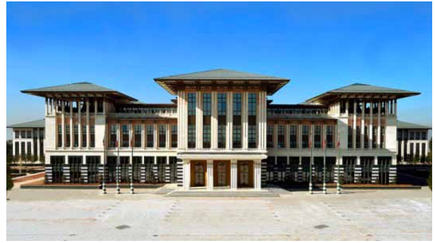
Fig. 4. White Palace of post-2000s period, by Birkiye (Arkitera 2015)

The architectural language of the Palace is consisted of wide roof trees, column series, and Ottoman and Seljukian adornments in order to compose the Revivalist approach. The building has a symmetrical and axial mass design. Each façade of the Palace displays its rules of composition with columns, windows and doors. In order to emphasize the vertical elements of the composition, double and triple column groups are used in the facade. The rates and proportions of the space and mass also contribute to the strict symmetric design of the building. The monolithic structure of the block is divided by the multiple ceiling covers.