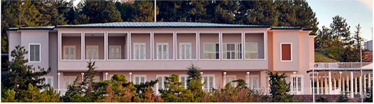
Fig. 1. Cankaya Palace of Kemalist period by Holzmeister (Presidency of Turkish Republic 2015)

claim that, Holzmeister used “modern monumentality in representing state authority with hidden layers of classism” (2012: 84).